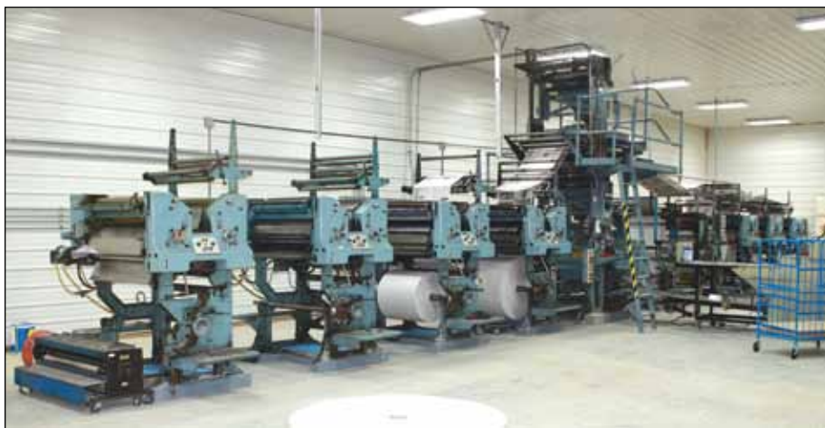
This is the new press installed by the Mound City News . The weekly printed its first edition in its own plant on Oct. 7.

A lively comment section might be enough to get readers on board, said Clay Shirky, a Columbia native who now writes about technology in New York. He noted that people are willing to pay for conversation in other online communities. (From a story in the Columbia Daily Tribune , Nov. 16).