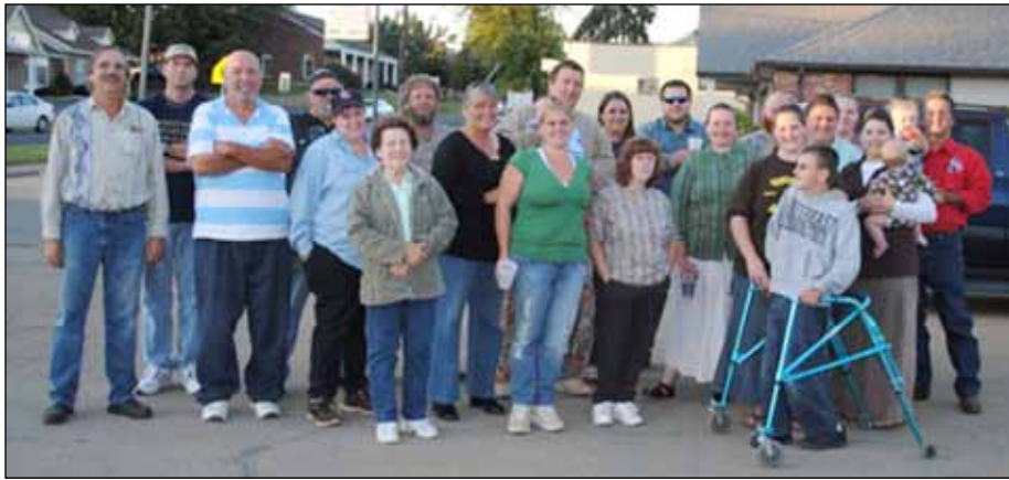
These contract carriers for the Park Hills Daily Journal gathered in October for a barbecue picnic in observance of International Carrier Appreciation Day.