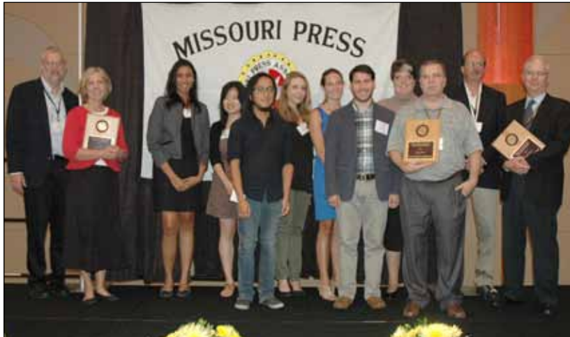
These people represent daily newspapers that won Gold Medal plaques.