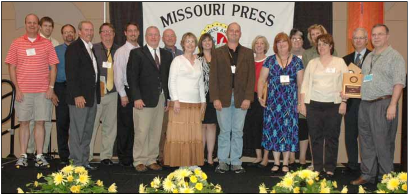
These are representatives of daily newspapers that won awards in the contest.