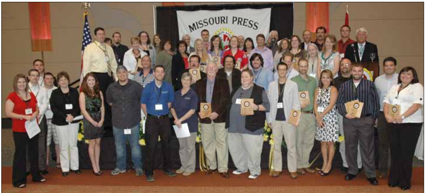
These are representatives of weekly newspapers that won awards in the contest.

3. Best Front Page —1: Christian County Headliner News. 2: Ozark County Times. 3: Smithville Herald. HM: Lawrence County Record.