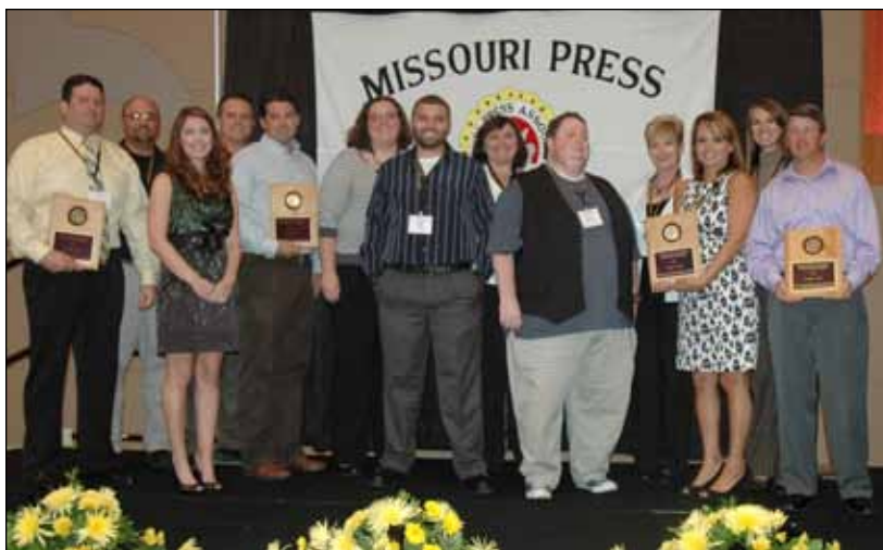
These people represent weekly newspapers that won Gold Medal plaques.

1. General Excellence —1: Branson Tri-Lakes News. 2: Springfield Business Journal. 3: Lee's Summit Journal.