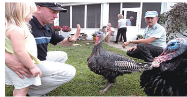
Photos like this one from the Missouri Photo Workshop website will be displayed in the Hall of Fame.

Sponsors of the project are the Missouri Press Association, Missouri Press Foundation, the Missouri School of Journalism, the city of Washington, the Washington Area Chamber of Commerce and the Washington Missourian .