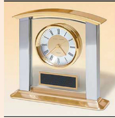
Foundation Builders will receive this desk clock as a token of their generosity.

Contact the Foundation at (573) 449-4167 for more information, or fill out the appropriate section of the pledge form below and mail or fax it to Missouri Press Foundation, 802 Locust St., Columbia, MO 65201; fax (573) 874-5894.